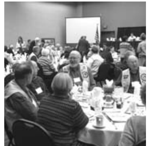
Members at the convention